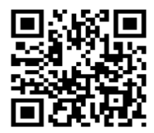
Fig (2.1) QR Code

QR code (abbreviated from Quick Response Code) is the trademark for a of matrix barcode (or type dimensional barcode) first designed for the automotive industry in Japan. A barcode is a machine-readable optical label that contains information about the item to which it is attached. A QR code uses four standardized encoding modes (numeric, alphanumeric, byte / binary, and kanji) to efficiently store data extensions may also be used. The QR Code system has become popular outside the automotive industry due to its fast readability and greater storage capacity